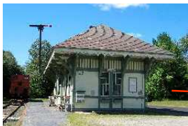
Potter Place Depot