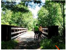
One of many River Crossings