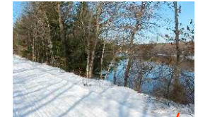
Merrimack River & Trail in Winter