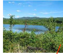
Mirror Lake & Mt. Cardigan