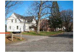
Webster Place (Daniel Webster Farm)