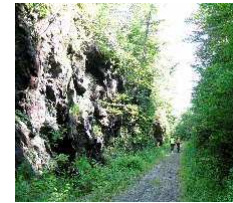
Orange Summit Rock Cut