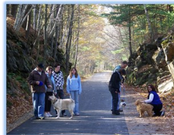
Windham Rail Trail

The final trail would be similar to other trails in the region. When complete the Londonderry Rail Trail would be a portion of the 29 mile trail Salem to Concord Bikeway with connections to the Portsmouth Branch Rail trail