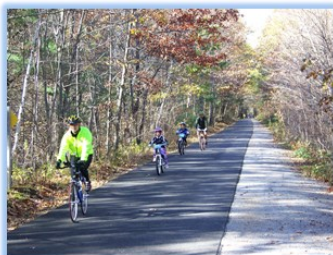
Expected Trail Surface

Development is envisioned in seven phases with each section